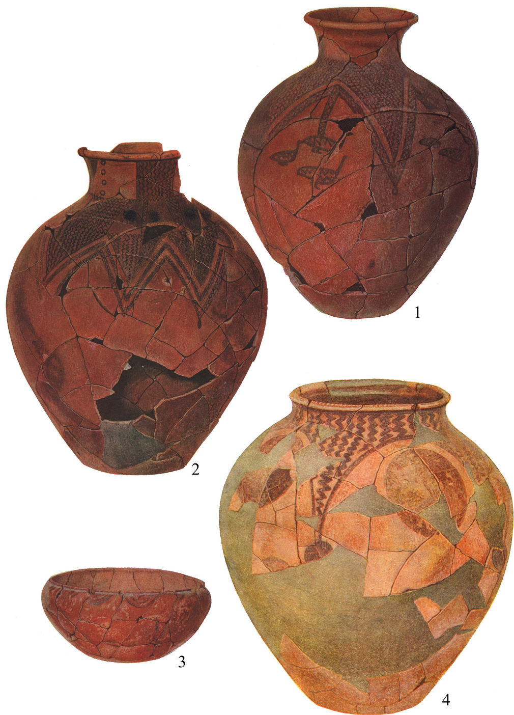
III – Painted black on the red surface by the so-called “water scheme motif” pottery