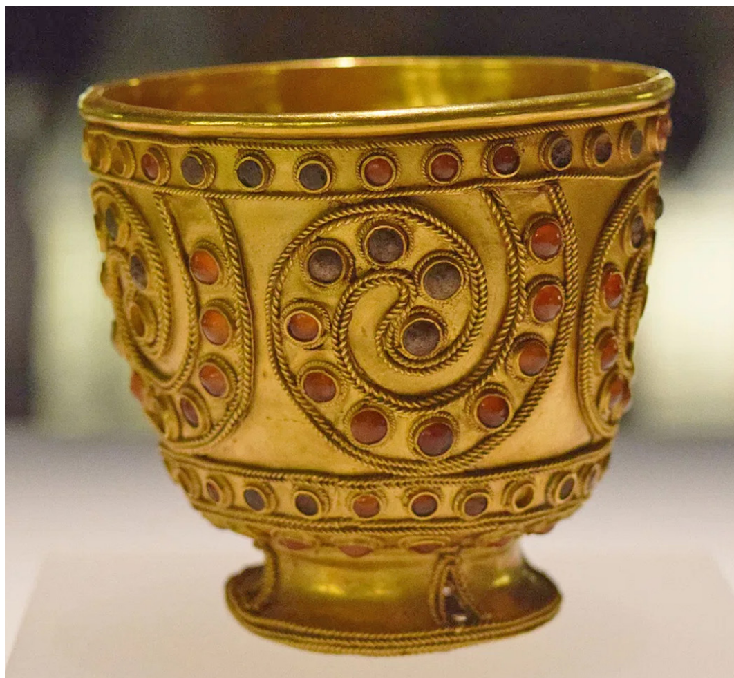
X – Gold beaker, decorated with filigree, granulation and inlays with various semi-precious stones from Tsalka # 17 barrow (B. Kuftin, Archaeological excavations in Trialeti, I. An attempt of periodization of sites , 1941, Pl. XCIII).