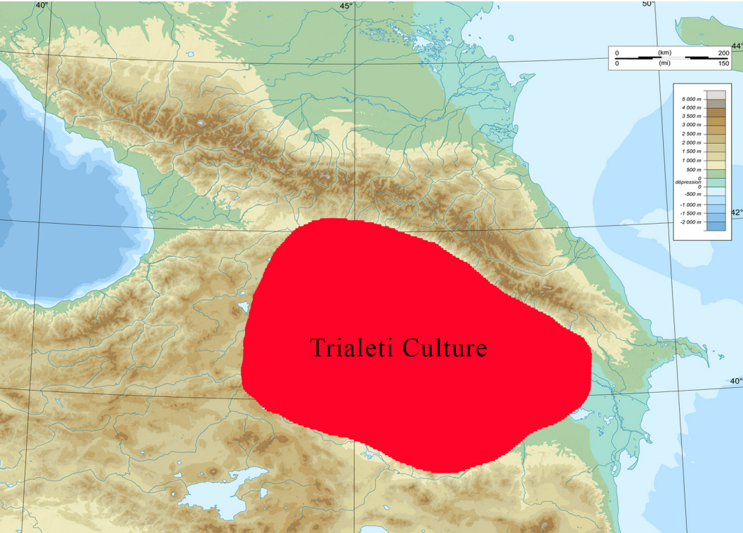
I - Map of distribution of the Trialeti Culture (after Puturidze M. For the artifacts depicting Sumer’s influence in the Trialeti Culture. in: Oriental Studies, # 9, Tbilisi, 2020, Tab. I)