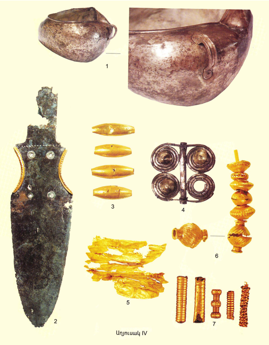
IX – Gold and silver artifacts from the Trialeti Culture (Lori Berd kurgans: # 65 (Pl. IV 1-3,5) and # 94 (Pl. IV 4,6,7) (after Devedjian S. Lori Berd, II (Bronze Moyen), Erevan, 2006, Pl. IV).