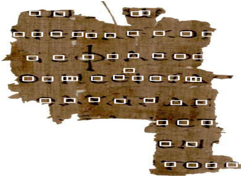
Figure 3. A visualization of the processing performed by the pipeline using the same Ancient Lives fragment from Figure 2.

The MySQL database also reads the rotation information for each fragment.