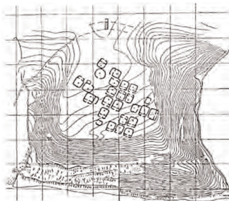
"Kvatskhelebi". Master Plan of the Former Structure.